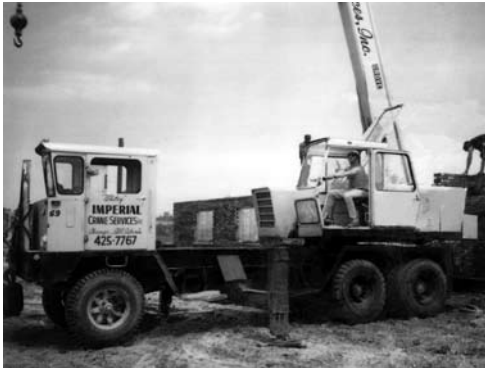
Larry Gedmin operating Imperial's first crane, a 15 ton Grove, in 1969. Larry currently runs the Griffith, Indiana location.