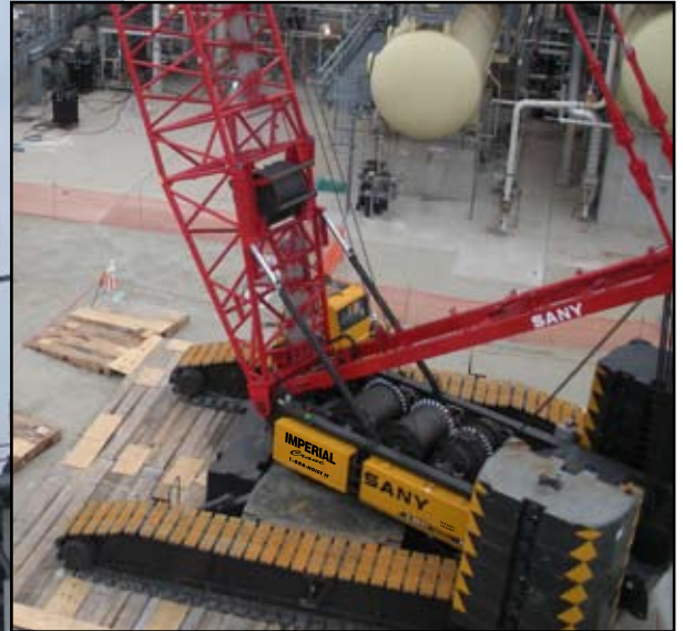
355 ton Sany setting 93,000 lb. fin fan for CITGO'S ULSD project.

Imperial saw an opportunity to unite with the expanding organization and partnered with Sany America as the Midwest distributor of crawler cranes.