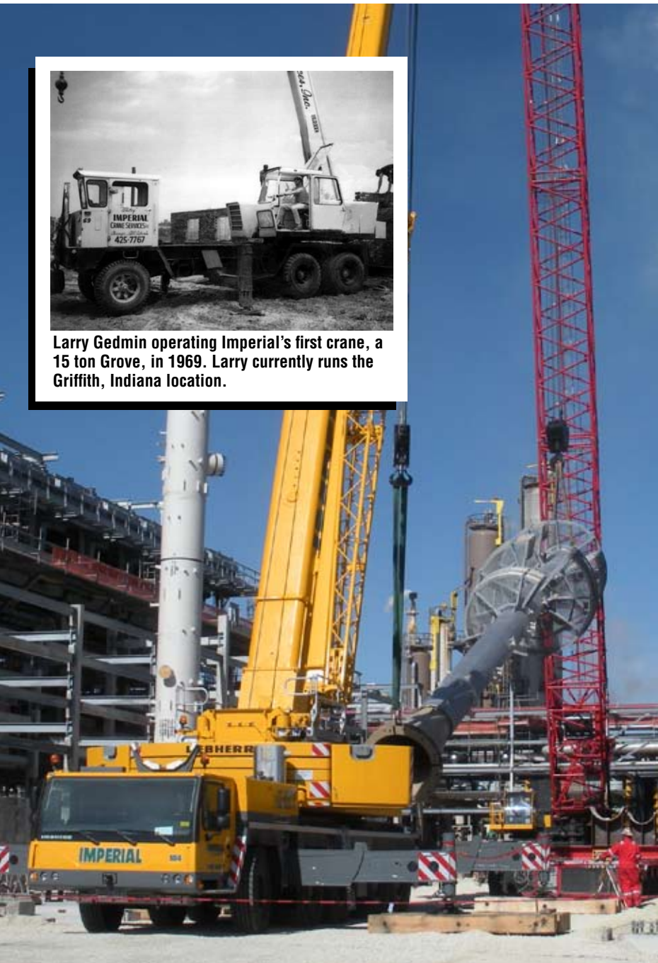
235 ton Liebherr works in tandem with 350 ton Sany crawler at CITGO refinery project.