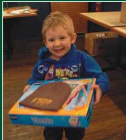
Imperial Crane donated iPods, PSP Systems and V-Tech Learning Systems for the children of SOS Village, an alternative to foster care.